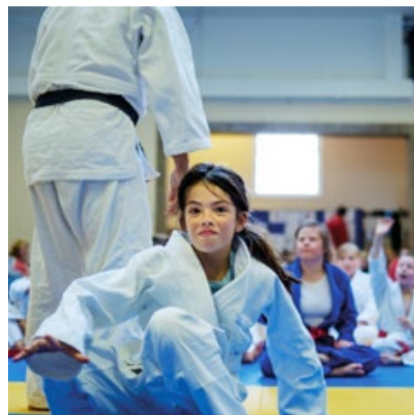
Rush Judo, an inclusive community club for all levels of ability

Many of us who live and work here cherish this special county. We feel connected to our community, and want Hertfordshire to thrive for generations to come.