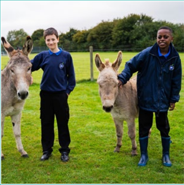
Friends of St Luke's School - a Special Educational Needs School for children with learning disabilities and complex needs