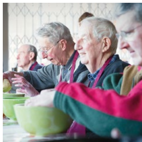
The Kitchen Front CIC, teach cooking and provide affordability workshops to men who have suffered a bereavement

Local organisations can change the lives of local people, with your support. From providing a child's bed to a family in need to running a carer's support group to operating a local domestic violence helpline, every gift, no matter the size, makes a difference in Hertfordshire.