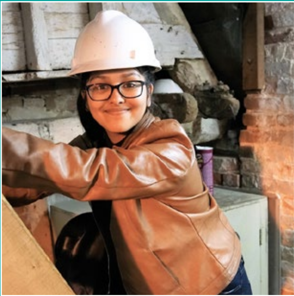
North Herts Minority Ethnic Forum - provide advice, guidance and support to minority ethnic communities

Talk to us about your gift in your will.