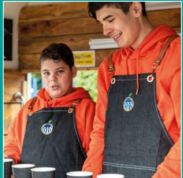
Blue Tangerine Federation - Specialist & Special Educational Needs Schools