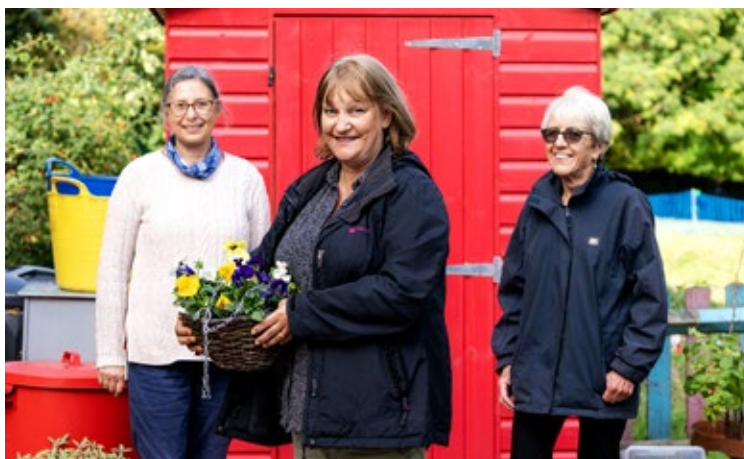
The Red Shed, providing horticultural therapy for people living with dementia and their carers