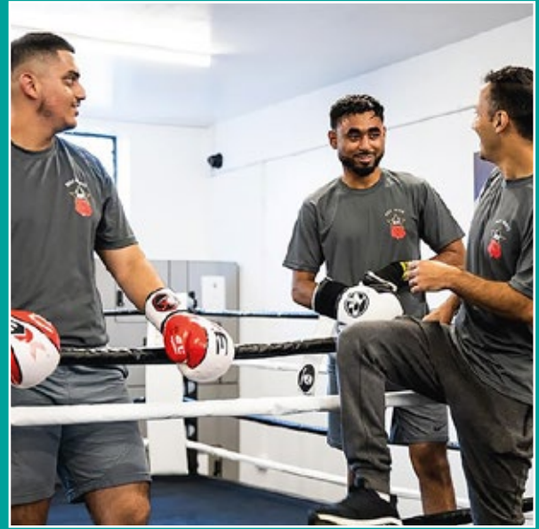
West Herts ABC, a sport for good project encouraging young people to make positive choices