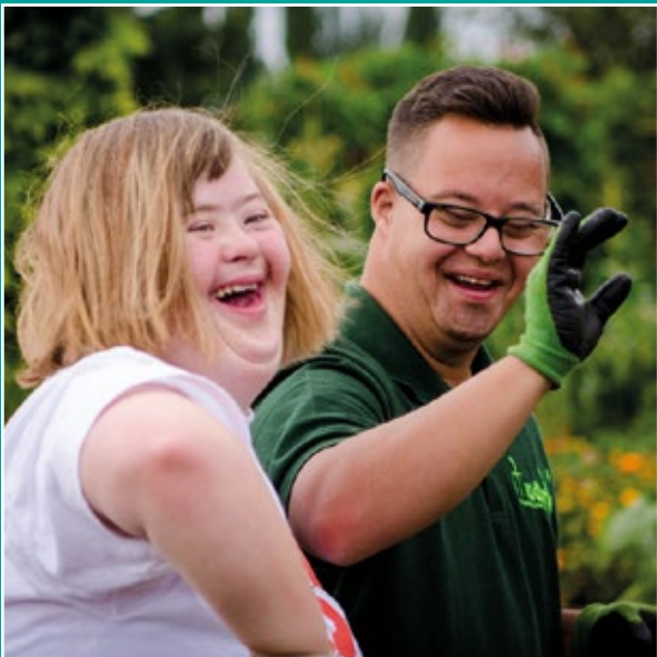
Mudlarks - support adults with learning disabilities and mental health issues

We can offer any support you need and would love to discuss the type of gift you wish to leave, and the impact you would like to have on our community.